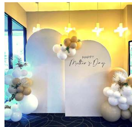
WOODEN ARCH WALLS $200