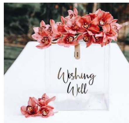
CLEAR WISHING WELL $40