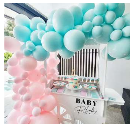
ADD A BALLOON GARLAND TO YOUR HIRE ITEMS FOR $65 PER METRE