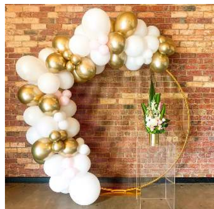
GOLD MESH WALL $100