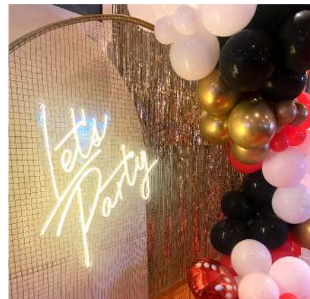
LET'S PARTY LED SIGN $100