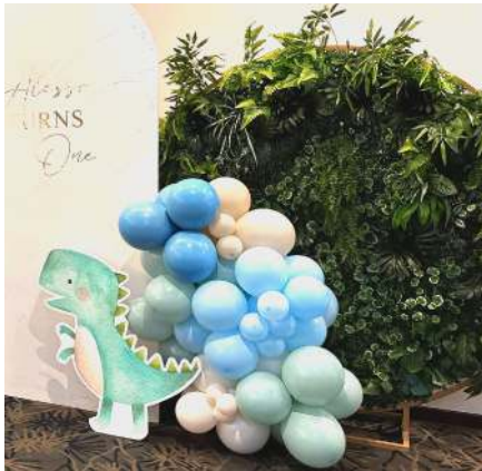
GREEN WALL $150