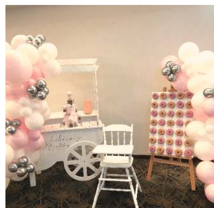
CANDY CART $150