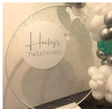
WHITE MESH WALL $100